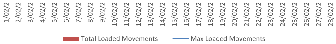
Graph 3 - Movements per Hour