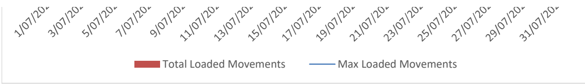
Graph 3 - Movements per Hour