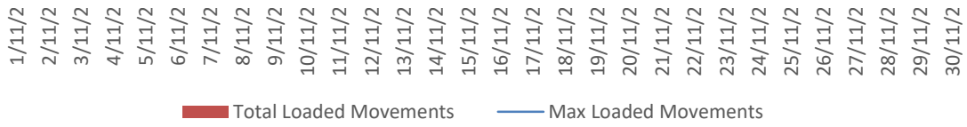
Graph 3 - Movements per Hour