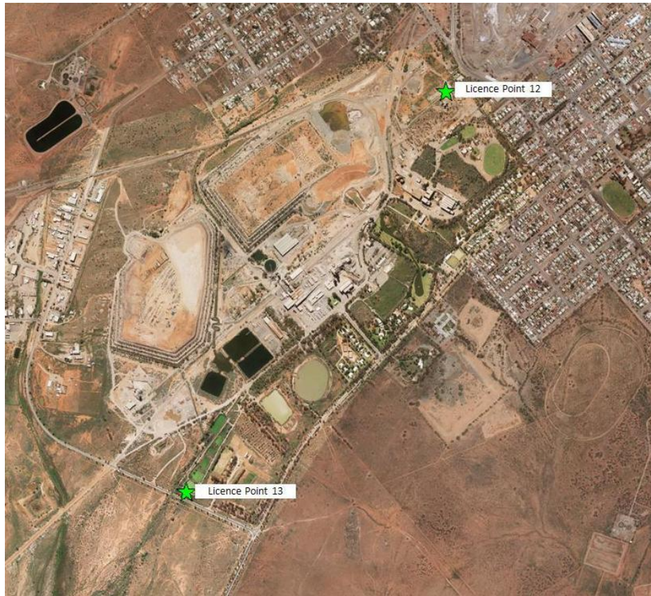
Figure 2. Location of the HVAS associated with EPL 2688.

Table 3 provides a summary of EPL 2688 conditions.