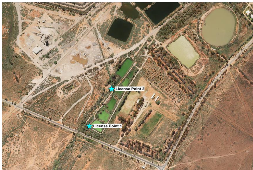
Figure 5. Location of the EPL2688 licenced discharge points.

A diversion drain was constructed in the last quarter of 2016 to ensure that water from Railway Town could pass through the Perilya Operation without being contaminated by mine water. A mechanism was installed to allow harvesting of this run off from residential areas when site water storage is low and the capture will benefit the operation.