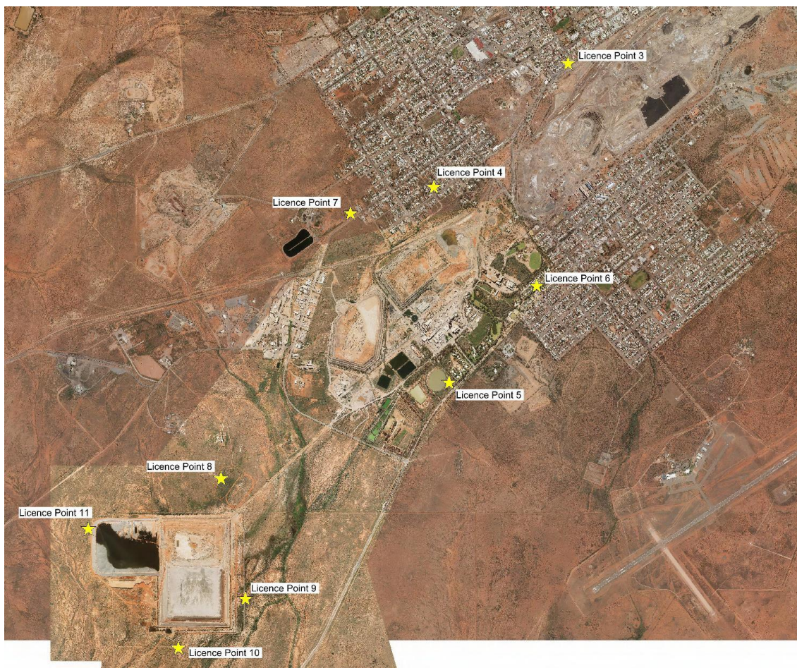
Figure 1. Location of the EPL 2688 deposition dust gauges associated with Perilya's Southern Operations.

Perilya Broken Hill Limited (PBHL) has nine (9) deposition dust gauge stations located at strategic points around the Southern Operations site (Figure 1). A summary of Environmental Protection Licence (EPL) 2688 conditions is shown in Table 1.