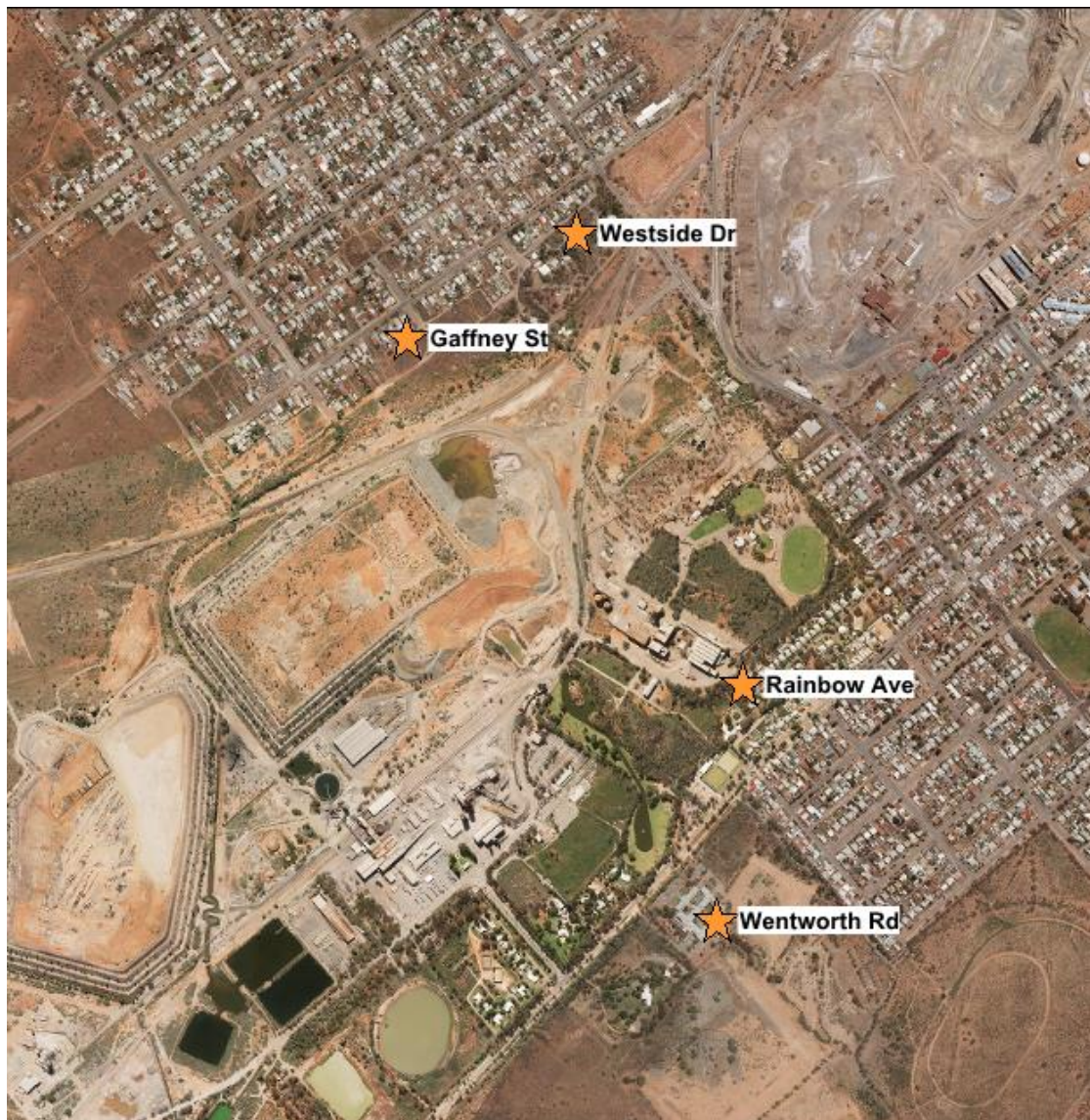
Figure 6. Location of EPL2688 blast monitors.

PBHL has four (4) blast monitors associated with the Southern Operations (Figure 6). A summary of EPL 2688 conditions for blasting is provided in Table 7.